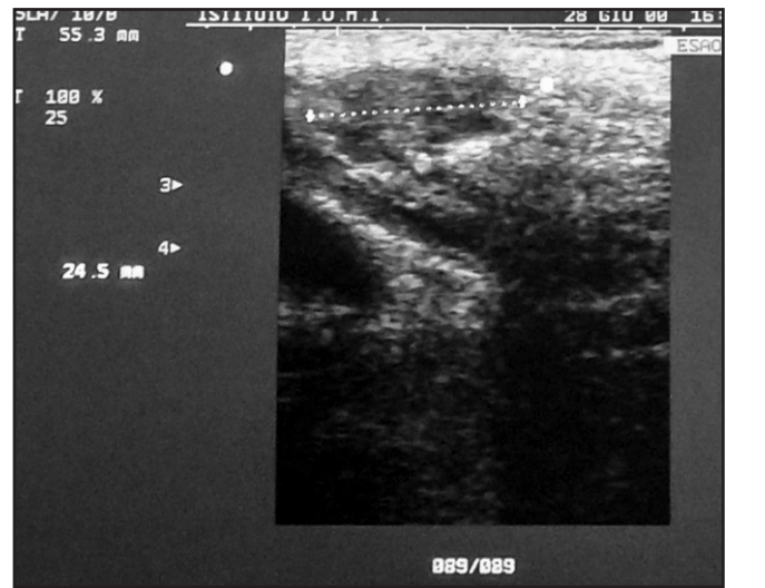
Congenital fibrosarcoma in a 14-year Follow Up